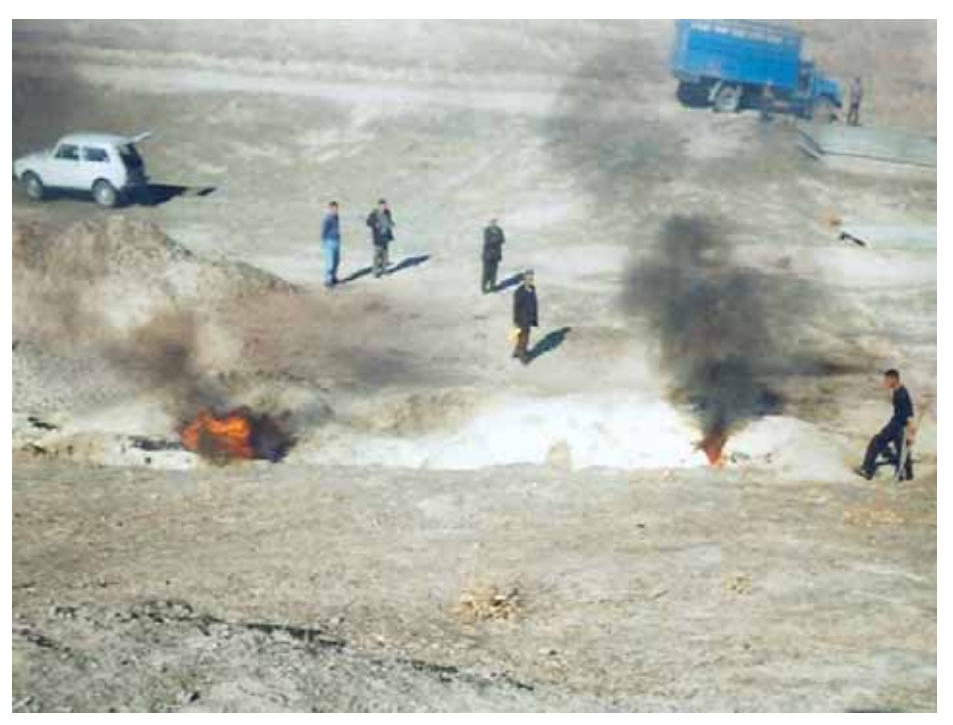
Illegal digging and burning of OPs at large burial sites. These pesticides are shamelessly repackaged and provided with new labels and sold at regular markets.