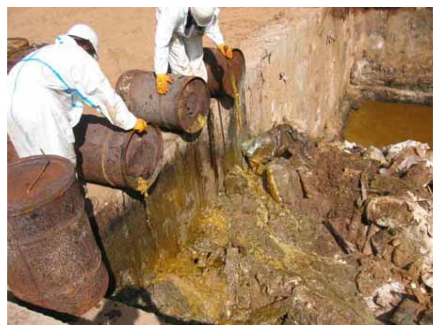
Ongoing clean-up actions in Lithuania.

(Directorate General for Environment) published a report on "Obsolete Pesticides Status in Candidate Countries (European Commission, 2002). The studies covered the ten accession countries that became members in 2004, i.e. the Czech Republic, Cyprus, Estonia, Hungary, Latvia, Lithuania, Malta, Poland, the Slovak Republic, and Slovenia. It provided a status report in each of the applicant countries of stockpiled OPs, including POPs, and their management. Further, the study identified issues and future challenges related to meeting the requirements of the Stockholm Convention on POPs. To date no such report currently exists for ENP countries. The FAO is planning to publish in the course of 2009 a report on the Central Asia countries.