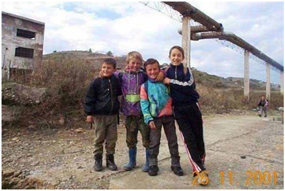
Children have been playing for many years at the storage site of HCH waste residuals near Porto Romana, Albania, which was cleaned up in 2006 with the support of the Dutch government.

guarded and all amounts have been accurately registered. However with the collapse of the Soviet Union's central control system, polygons were abandoned, fences were torn down and pesticides were illegally excavated, repackaged and sold on to local markets or exported by organised crime. Polygons – in the sheer nature of the concept – comprise a limited number of very large sites, often in combination with other hazardous wastes.