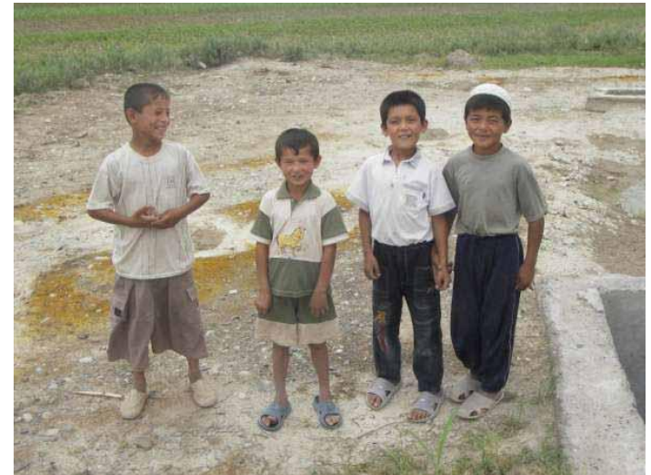
Playing on obsolete pesticides, these children are exposed to enormous dangers.